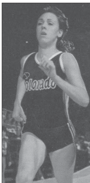
Mary Decker 1978 (AIAW)

Tenth months after she bettered her own world record in the 1,000-meter run, Mary Decker won Colorado's first national cross country title in her last race, on CU's then-home course, Kent Denver Country Day.